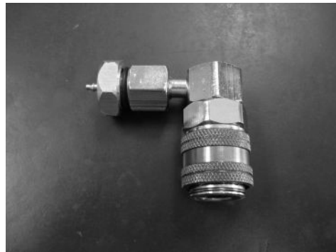
Coupler with Filter